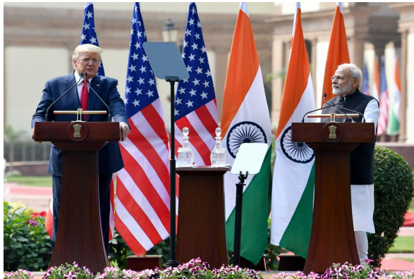
US President Donald Trump and Indian Prime Minister Shri Narendra Modi

At the invitation of India's Prime Minister Shri Narendra Modi, US President Donald Trump paid his first State Visit to India on February 24-25, 2020. He was accompanied by his wife First Lady Melania Trump, daughter Ivanka Trump and son-in-law Jared Kushner, as well as a high-level delegation. The visit began with the "Namaste Trump" event in Ahmedabad where President Trump inaugurated the world's largest cricket stadium, the Sardar Patel Stadium and addressed a crowd of more than 100,000 Indians. President Trump and the First Lady paid tribute to Mahatma Gandhi at