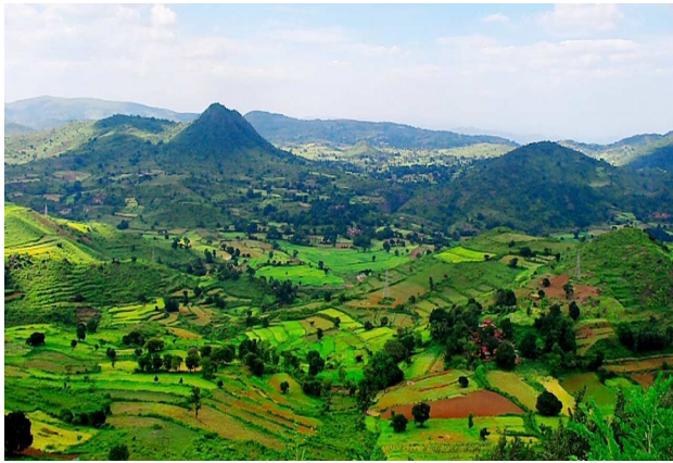
Araku Valley

In 2019, the number of domestic tourist arrivals in Andhra Pradesh was 195.8 million, and the number of foreign tourist arrivals was 0.23 million. The state is well-known for its pristine beaches, sacred places of worship, lush green forests, spicy cuisine and hospitable people, and some of the most famous tourist attractions in the state are the ancient and sacred pilgrimage sites of Tirumala, where the Lord Venkateswara Temple is located, and Tirupati, which is home to several magnificent temples such as Varahaswami Temple. Other tourist attractions include Visakhapatnam, also known as Vizag, which is the state's largest city and is surrounded by several beaches along the Bay of Bengal coast, scenic hills, valleys and caves, and the Araku Valley which, at an altitude range of 900 to 1400 metres above sea level in the Eastern Ghats, has lush greenery, waterfalls and streams, and is famous for its coffee plantations.