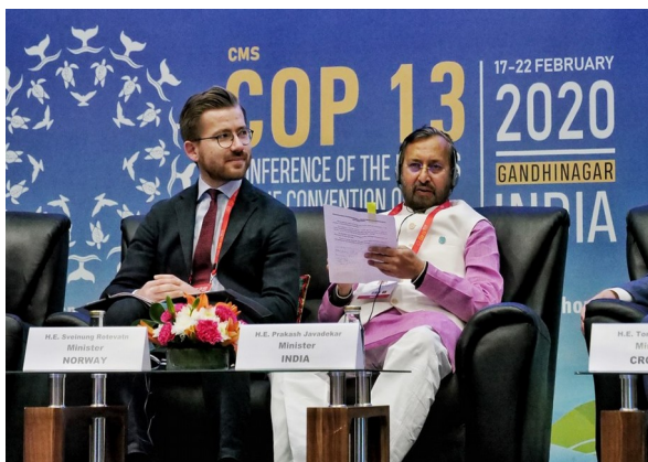
Norwegian Minister Rotevatn and Indian Minister Javadekar