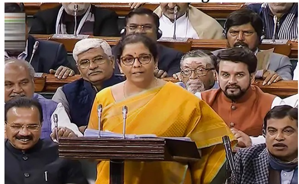
Finance Minister Smt. Nirmala Sitharaman presenting the Union Budget 2020-21