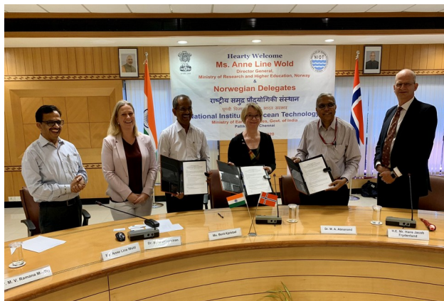
Visit of Norwegian education and research delegation