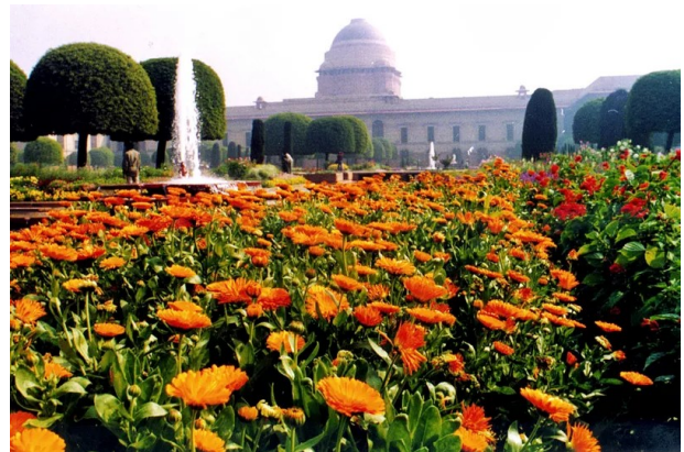
Udyanotsav Festival

residence, which was opened up to the public on the occasion. Guests were also invited to visit special themed gardens such as the Spiritual Garden, Herbal Garden, Bonsai Garden and Musical Garden.