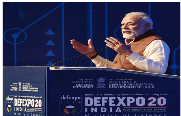
PM Modi at the 11 th Defence Expo India 2020

On 5 February, Prime Minister Shri Narendra Modi inaugurated the biennial 11 th Defence Expo India 2020, which was held in Lucknow, Uttar Pradesh from 5 to 9 February. The Defence Expo India is one of India's largest defence exhibition platforms and one of the leading defence exhibitions worldwide, and gathered more than a thousand defence manufactures and 150 companies from all over the world. PM